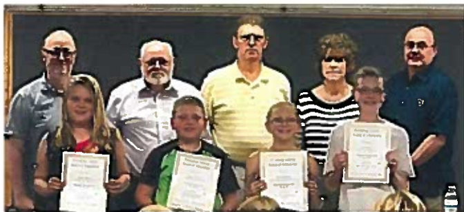
Regional Science Fair (Grades 4-5)