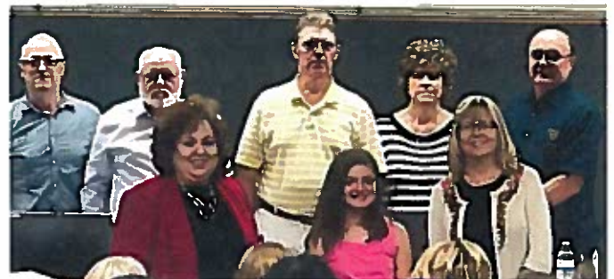
WV 529 Plan Essay Contest Winner