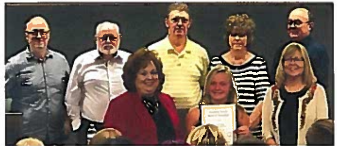
Young Writer's Contest, County Winner