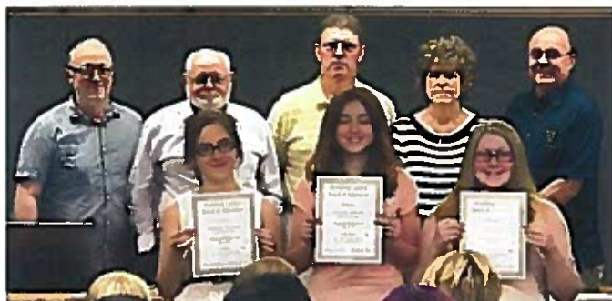
Regional Science Fair (Grades 6-8)