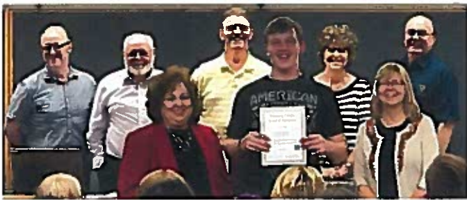
Regional Math Field Day