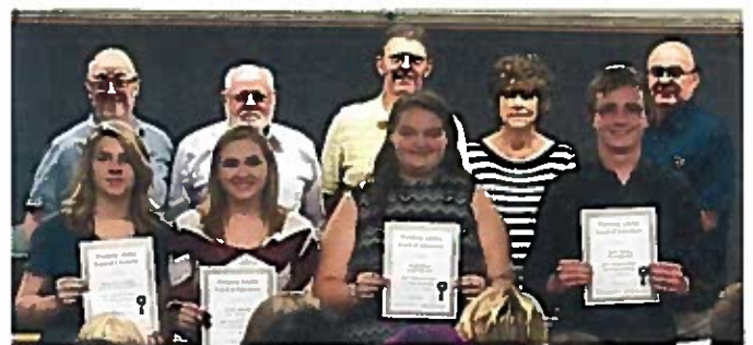
2017 Governor's School for Math and Science

On Tuesday, May 30, the Wyoming County Board of Education honored students for their success in the WV State Theater Competition, Regional Science Fair (Grades 4-8), Sons of the American Revolution Knight's Essay Contest, Young Writers County Winner, Southern Conservation District Poster Contest, 2017 Governor's Honors Academy, 2017 Governor's School for Math and Science (grades 7-8), Wyoming County Public Speaking Competition, and Governor's Workforce Credential. A complete lists of those students are in the attachments section of the Bulletin .