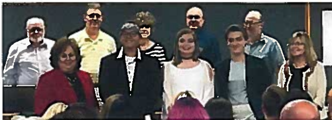
State Theater Competition Honorees—Westside High