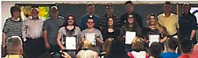
State Theater Competition Winner—Wyoming East