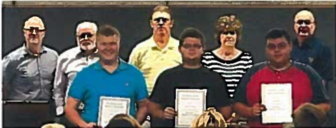
Governor's Workforce Credential