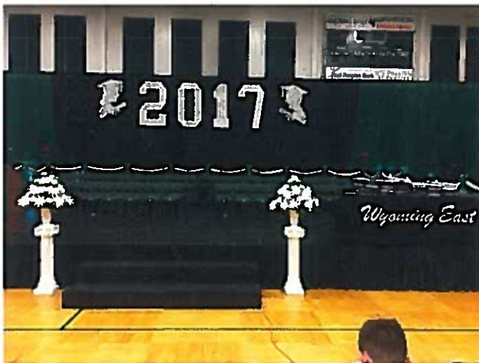
Wyoming East High School 138 graduates

Congratulations to all graduates and their families. Much success and happiness in your future pursuits. You will be missed! Thank you to the administration, faculty, and staff of each high school for all the hard work making the commencement exercises so special!