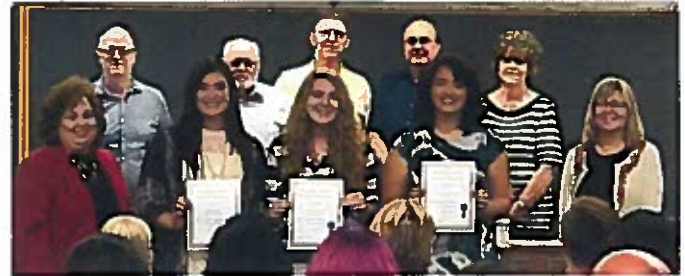
2017 Governor's Honors Academy