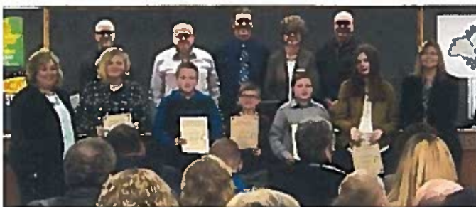
County Young Writers Winners