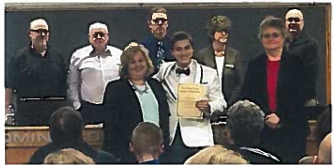
Southeastern Theatre Conference Mobile, Alabama