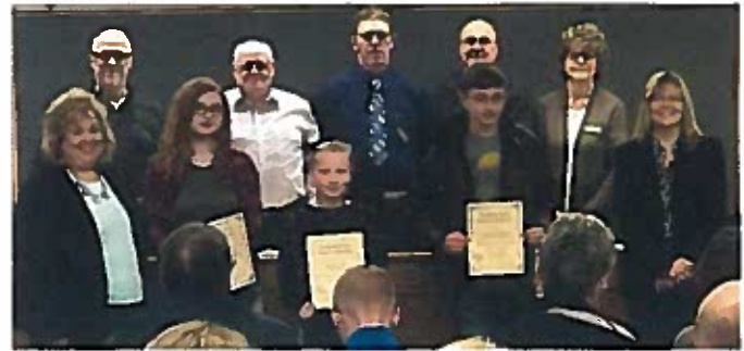
2018 Youth Art Month County Winners