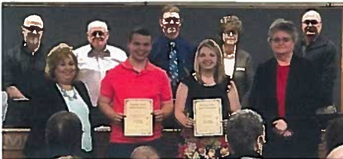
All-State Band Members