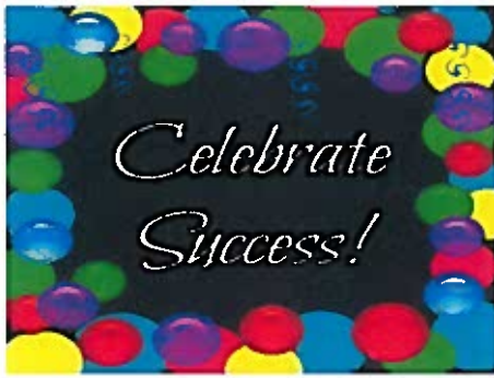
Wyoming County Board of Education Monday, April 9, 2018