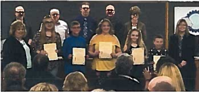
Regional Social Studies Fair First Place Winners