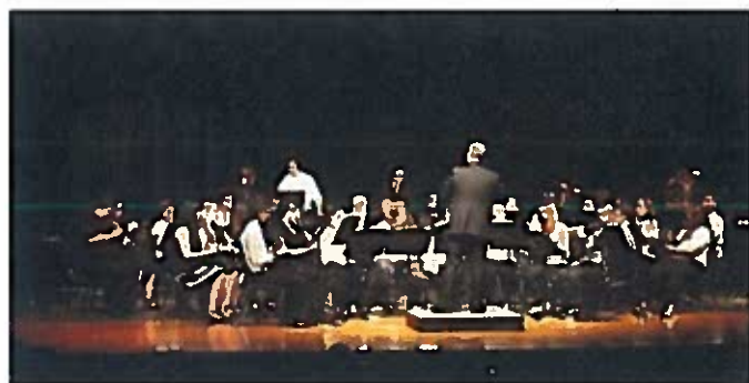
Middle School Band