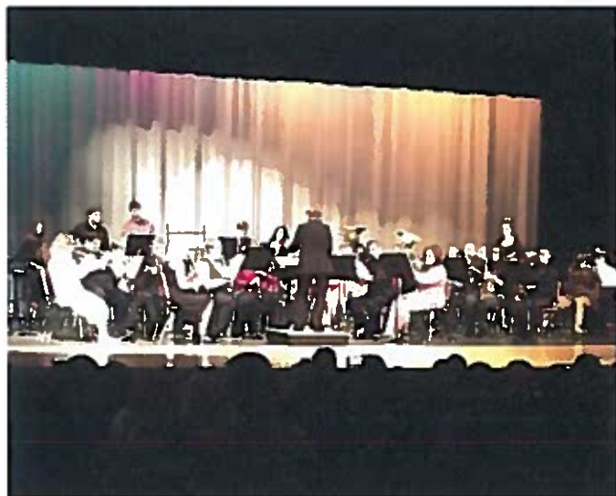
High School Band

A list of all students participating can be found in Bulletin attachments .